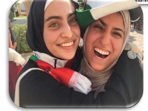
DPC and DMC celebrates the 44<sup>th</sup> UAE National Day.... "We're proud of the UAE. We salute the nation"